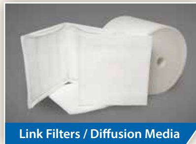
Link Filters / Diffusion Media