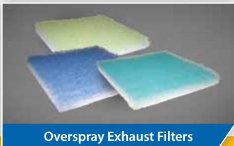
Overspray Exhaust Filters