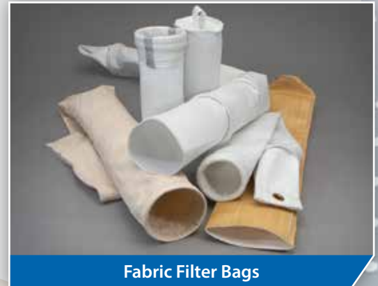
Fabric Filter Bags