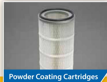
Powder Coating Cartridges